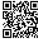
Image may differ from the actual product